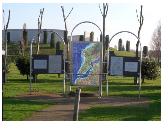
The Gallipoli memorial at the National Memorial Arboretum