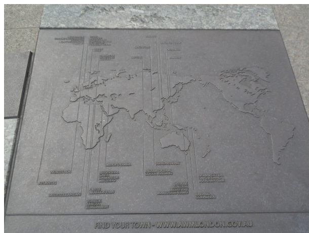
Australian war memorial, London © War Memorials Trust, 2015

War Memorials Trust 14 Buckingham Palace Road London SW1W 0QP Telephone: 020 7834 0200 / 0300 123 0764 Email: learning@warmemorials.org Website: www.learnaboutwarmemorials.org Registered Charity Number: 1062255 © War Memorials Trust, 2015