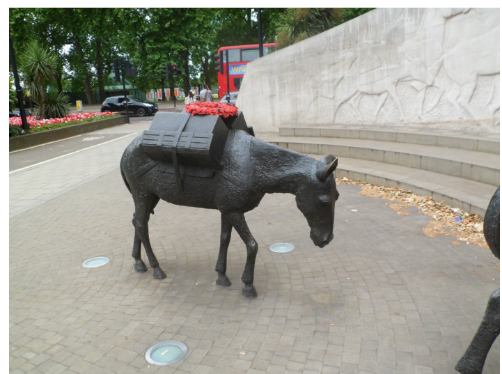
Animals on the other side of the wall