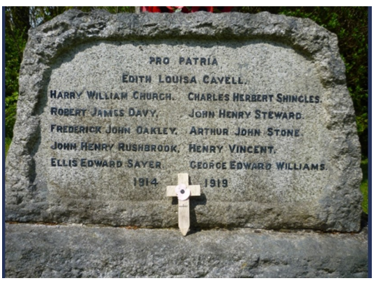
Swardeston war memorial cross

There are many other dedications and memorials to Edith Cavell around the UK, some of which take the form of buildings such as chapels and hospitals, reflecting the work she did.