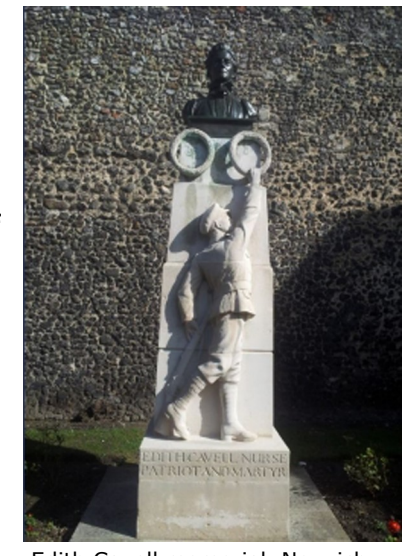
Edith Cavell memorial, Norwich cathedral

Cavell's home village's main war memorial is a stone wheel cross with a downward pointing sword carved in relief on the front face. It lists the names of those from the village who died in World War I, and Cavell is included in this list. There are also