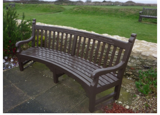
Edith Cavell memorial bench, Hunstanton.

Telephone: 020 7834 0200 / 0300 123 0764